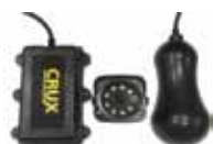
CTR-01Q Wireless Truck Camera