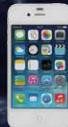
Wireless Smartphone Mirroring