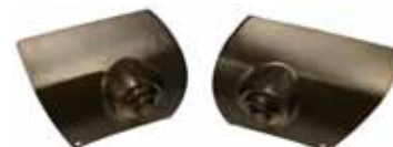
Toyota Tacoma Side Mirror Mounted Cameras