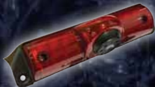
Multi-View Camera Integration