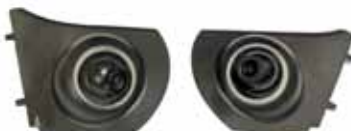
Toyota Highlander Side Mirror Mounted Cameras