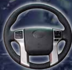
Steering Wheel Control Retention Interfaces