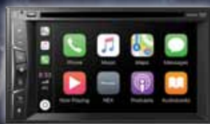
Radio Replacement Interfaces